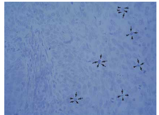
Figure 2. Signals produced by EBV probe in nuclei in warty carcinoma case. ISH 400×

Warty carcinoma of the uterine cervix is a specific, rare subtype of squamous cell carcinoma. It